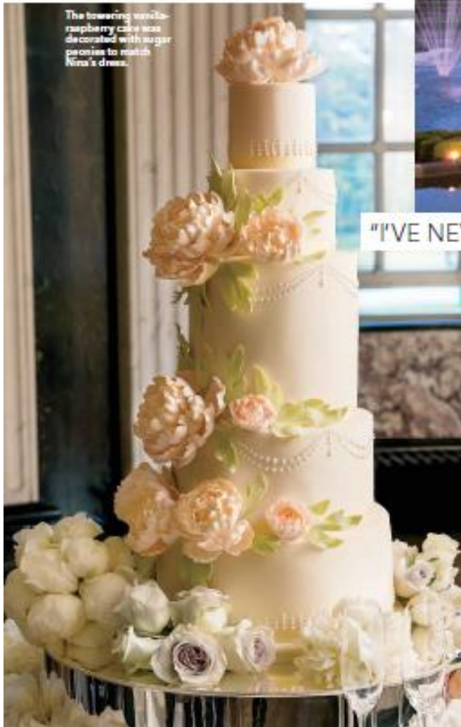
The towering vanilla-raspberry cake was decorated with sugar peonies to match Nina's dress.