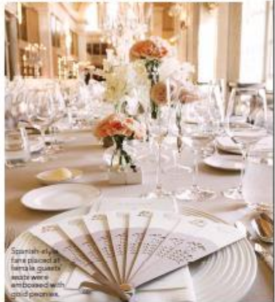
Spanish-style fans placed at formal guests' seats were embossed with gold peonies.

TO SEE MORE FORMAL WEDDINGS VISIT BRIDES.COM/REALWEDDINGS .