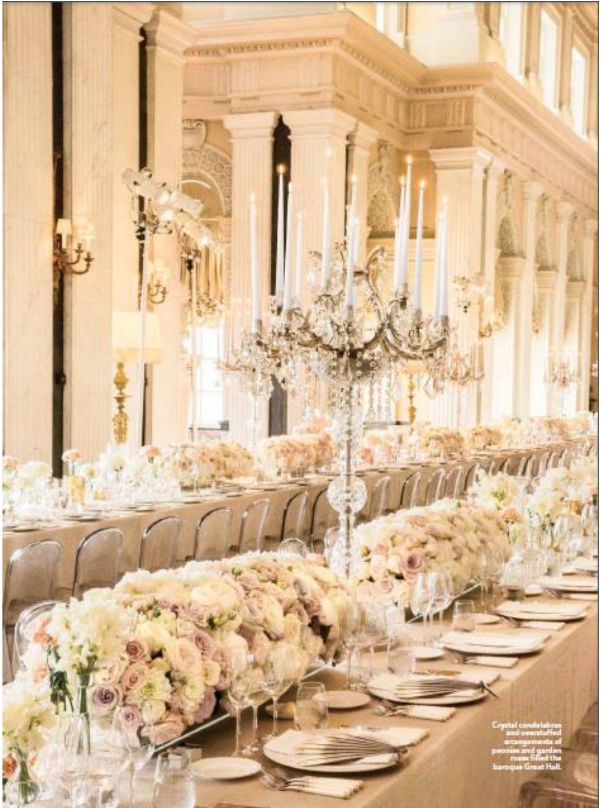
Crystal candelabras and overstuffed arrangements of peonies and garden roses filled the baroque Great Hall.