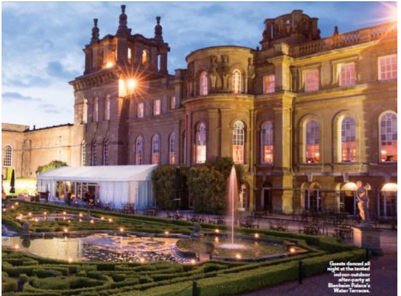
Guests danced all night at the tented indoor-outdoor after-party at Blenheim Palace's Water Terrace.