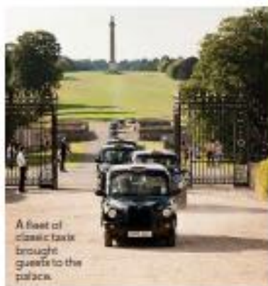
A fleet of classic taxis brought guests to the palace.