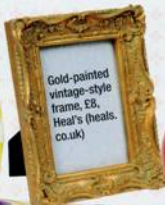
Gold-painted vintage-style frame, £8, Heaf's (heaf.co.uk)