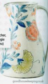
Garden Villa pitcher, £58, Anthropologie (anthropologie.eu)

FEATURE: CAROLYN BAILEY; PHOTOGRAPHY: GARY INTERIOR DESIGN; GET THE LOOK COMPILED BY: CLARE BURSILL