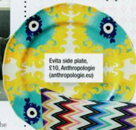
Evita side plate, £10, Anthropologie (anthropologie.eu)

Mix streamlined furniture and lamps with intricately patterned accessories