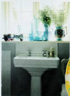
In the bathroom, some of Nikki's glass and ceramic jugs in blues and turquoise shades, filled with airy flowers, form an impromptu screen across the window