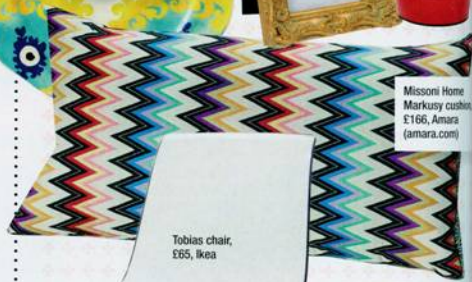
Missoni Home Markusy cushion, £166, Amara (amara.com)