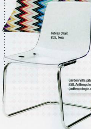
Tobias chair, £65, Ikea