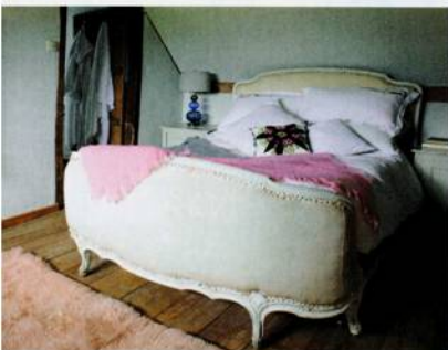
Upstairs, plain floorboards contrast with old-style linen, fluffy blankets and rugs, and striking cushions