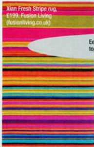
Xian Fresh Stripe rug, £199, Fusion Living (fusionliving.co.uk)