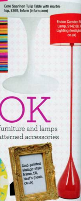
Endon Camden Pl Lamp, £142.00, Lighting (kestlight.co.uk)